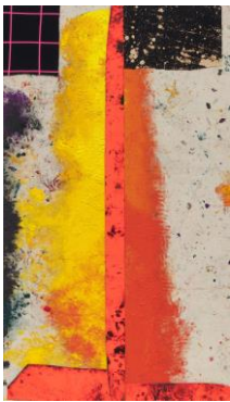
Sterling Ruby WIDW. HIGH-VIZ. Estimate: $250,000-350,000

Art for One Drop on 21 September to Offer 50 Works to Benefit One Drop’s Safe Water Initiatives