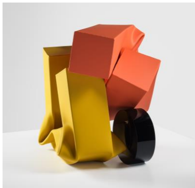
Carol Bove Young Lovers Estimate: $180,000-220,000