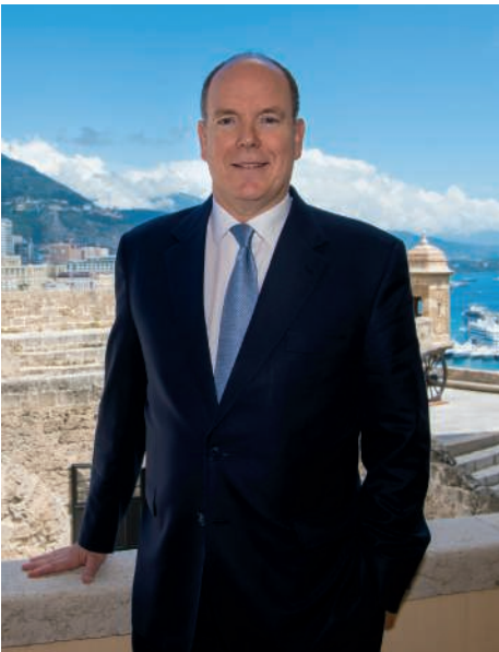
© Gaetan Luci - Palais Princier