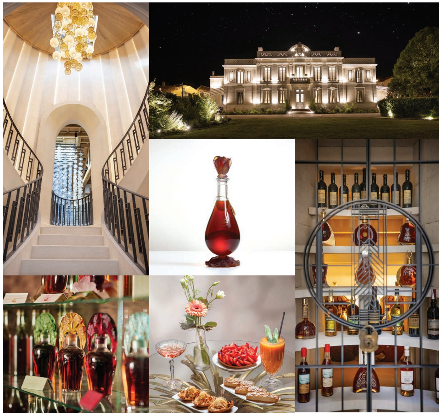
Photos of La Naue and the restaurant