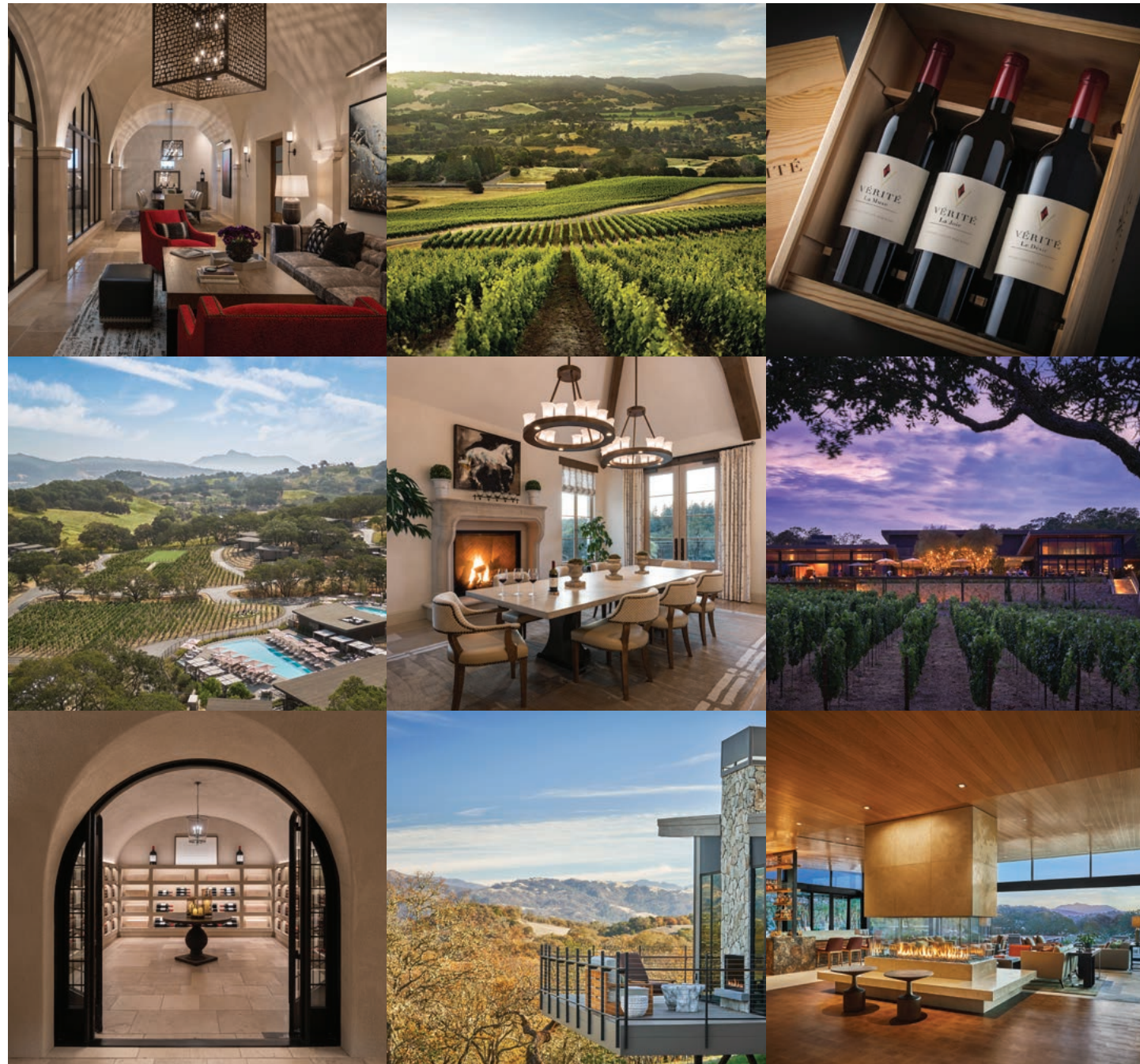
Photos of the Vérité Estate