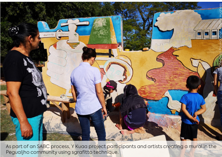
As part of an SABC process, Y Kuaa project participants and artists creating a mural in the Pegualjho community using sgrafitto technique.

Consequent findings from program monitoring revealed that 13% more people are practising handwashing with soap than when Lazos de Agua was first implemented. Better water coverage also influenced the onset of this behaviour, in addition to SABC interventions. 29% of interviewees also recognized that the change they perceived relates to empowerment, social cohesion, leadership, and/or artistic skill set: