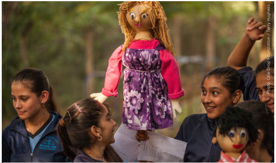
SABC workshop with students, participants of the Y Kuaa project in the Department of Paraguari, Paraguay.

“One of my fondest memories from the workshops as an Agent of Change was when a facilitator coached us and instilled in us the habit of modulating our voice. (...) This has greatly helped me in my daily life, as I always participate (...) and at the assembly meetings I need to tap into that voice”. - President of a Water User Committee in Nicaragua, participant in multiple activities speaking of an experience one or two years prior.